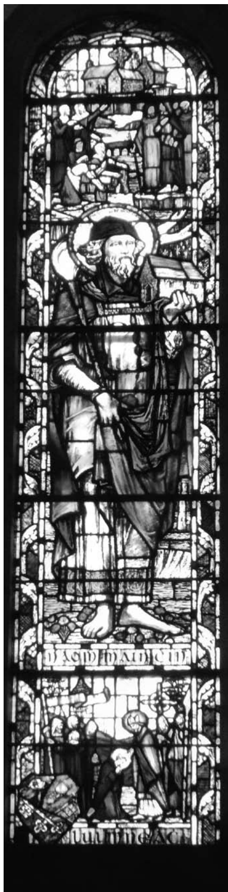
One of the stained glass windows of Honan Chapel, setting of the meditation.

welcomed us warmly, with a program that was rich in Irish culture and Celtic mythology. They showed concern for our physical wellbeing, yet kept us focused on what we came for: to experience and understand the role of silence and stillness in Christ in times of crisis.