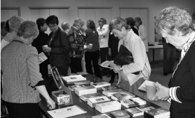
Stratford meditators gather to share their experience and knowledge together.

Meditators from around southwestern Ontario gathered on Sept. 17 at Central United Church in Stratford for a morning workshop on Christian Meditation and Balance in Daily Life. It was a time for sharing the silence of meditation, encouraging one another in the daily practice, and connecting with the wider community.