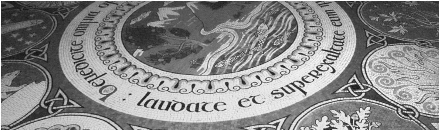
The mosaic floor of Honan Chapel, where the meditation was held.