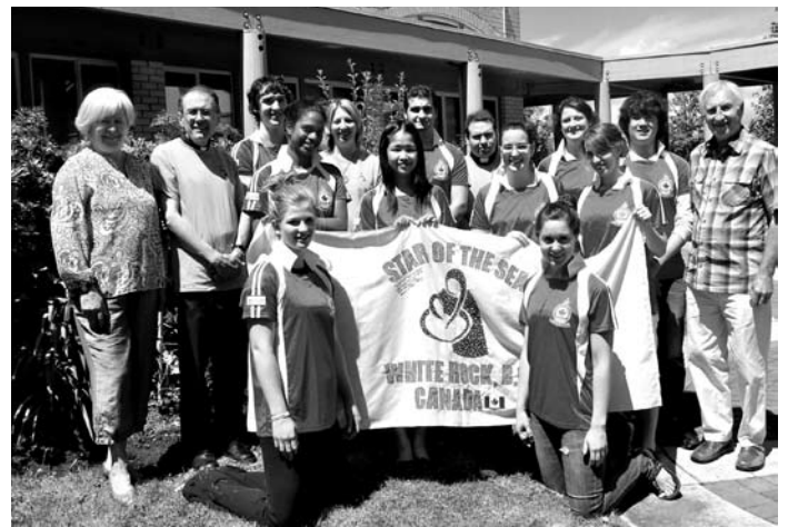
An Introduction to Christian Meditation to the World Youth Day Pilgrims, Star of the Sea Parish, Surrey, BC. July 2011